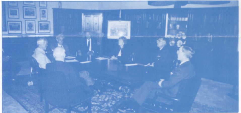
Secretary of the Air Force, Dr. Shiela W. Widnall, meets with The Friends Executive Committee on October 5, 1994.

The PROTOTYPE consists of three large volumes of selections we believe ought to be included in the finished