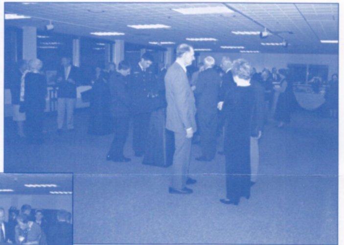
Members, sponsors, spouses and cadets attend the Gala.