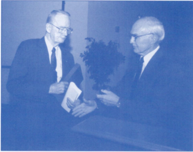
Brig. Gen. Caine telling Lt. Gen Clark that the Genesis of Flight has been dedicated to him.