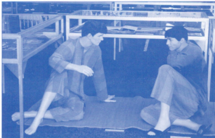
A view of the Southeast Asia POW exhibit. The mannequins are wearing the pajama-type uniforms worn by American prisoners.

This fine collection is now the largest and most definitive collection of its kind in the United States. By 2003, the 30th anniversary of "Operation Homecoming", this collection will be enriched by additional material from the Department of Defense and by creating CDs and interactive DVDs that will make available substantial portions of the documentary materials and artifacts for use on personal computers. A substantial portion of the collection is on display on the main floor of the Academy Library.